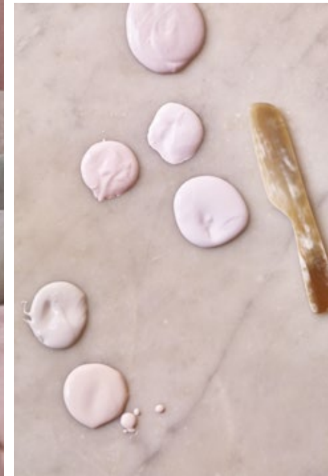
A cocoon of comfort, chalky shades of dusky pink, rose quartz and thistle-down exude a peaceful serenity and delicate femininity.