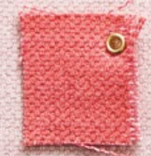
#425 RED CORAL

Conjuring the alluring notes of colourful spices, rich tones of cayenne, turmeric and pumpkin immerse the senses in a warming palette of sun-drenched hues.